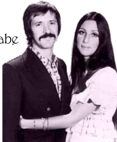
Sonny & Cher