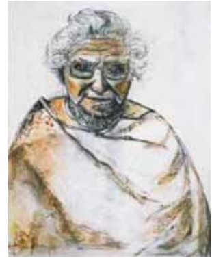
Oodgeroo Noonuccal (Kath Walker) 1920-1993