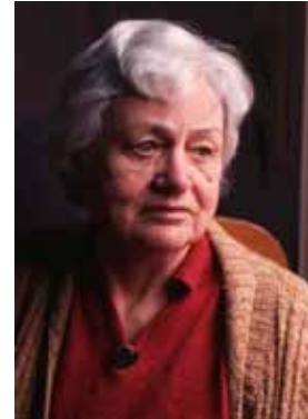
Judith Wright (1915-2000)

We're a bunch of damned whores and we never wear drawers, And they say we're the cause of dissension. But never you fuss before you judge us, There's a few things that we'd like to mention.