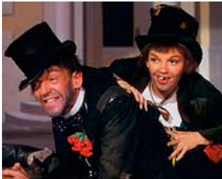
Fred Astaire & Judy Garland ('Easter Parade' 1948)