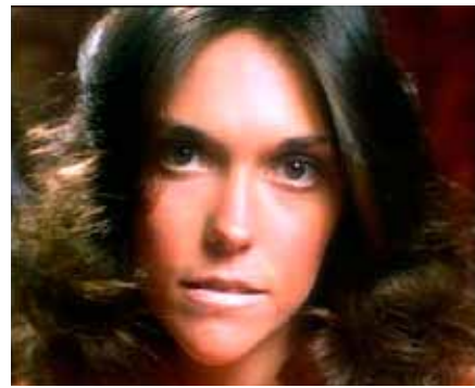
Karen Carpenter (1950-1983)