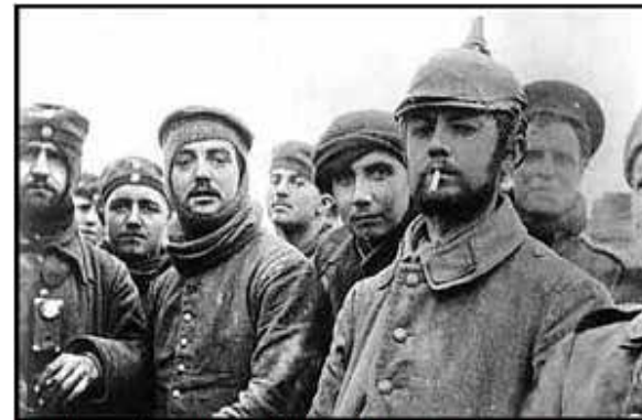
British and German soldiers fraternize during the "Christmas Truce" of 1914